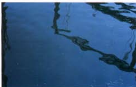
40 Seconds Later