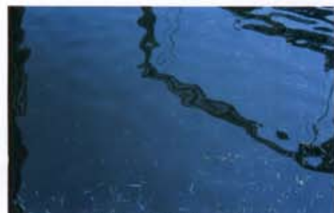
20 Seconds Later