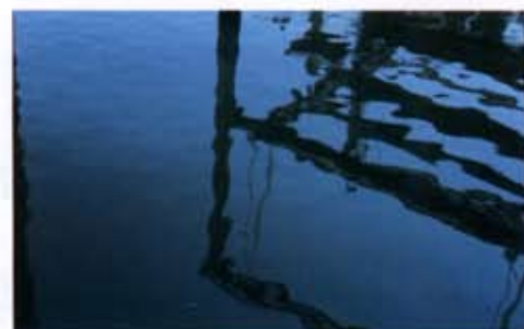
60 Seconds Later